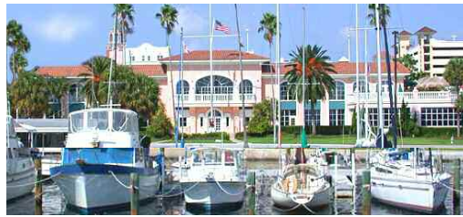
SPYC downtown clubhouse

The SPYC and Fleet 801 have hosted previous Junior Worlds, Masters, and Women's Worlds. The fleet is currently on the move. In the last year, Fleet 801 placed the highest married couple at the US Nationals, the highest placing juniors at the North Americans, and fleet members in the top five of many major regattas. After creating the Super Snipe Trailer (holding up to a dozen boats) and providing three loaner boats to the public, the membership is growing and espe-