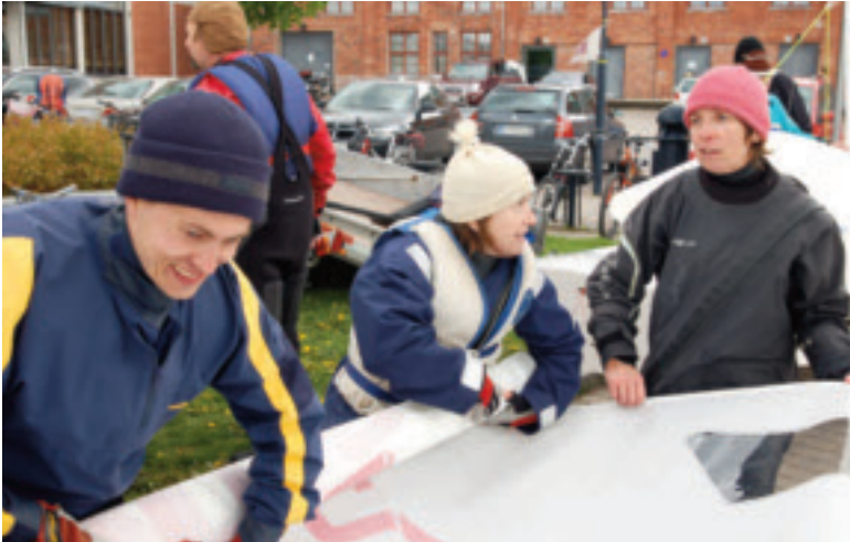
Snipe Sailors do it together!

The latest spring fashion from the Artic Circle. Please note the rounded rabbit ears that make all the girls crazy! And the metal wire to keep it attached to the right ear.