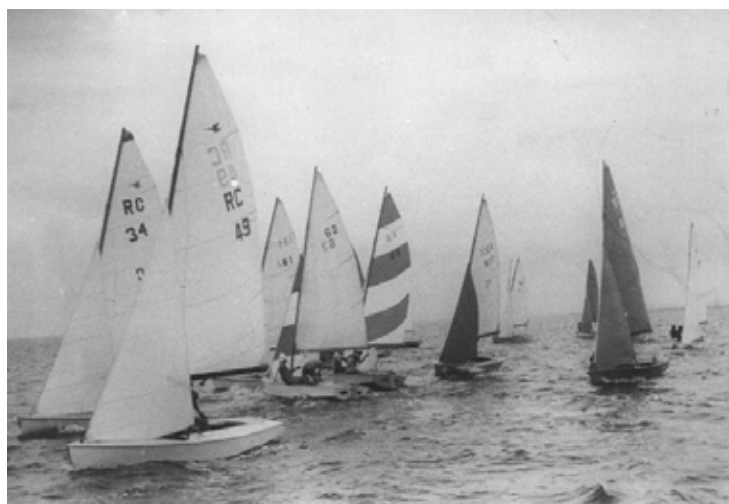
“La Estrella” ( Flota de Caibarién, década 1970-1980).