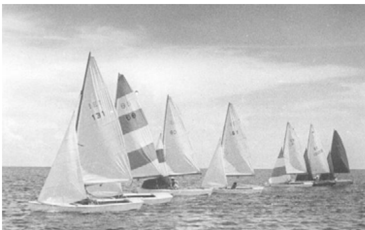
La Estrella” 2000