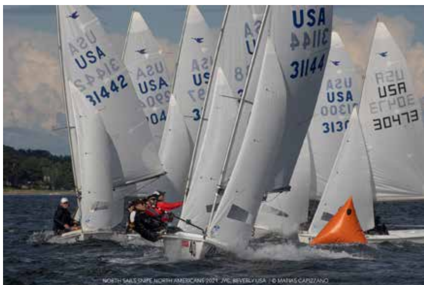
NORTH SAILS SNIPE NORTH AMERICANS 2021 - JVC, BEVERLY, USA