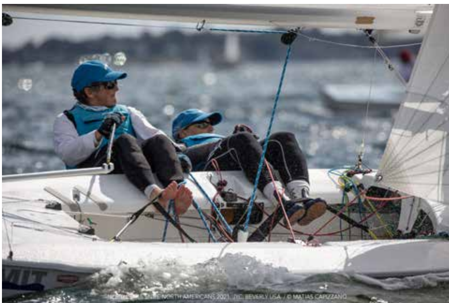
NORTH SAILS SNIPE NORTH AMERICANS 2021 - JVC, BEVERLY, USA