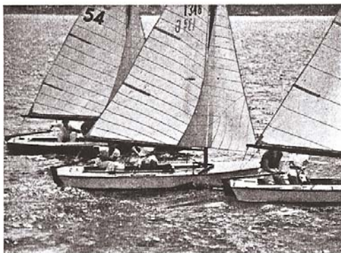
Snipes Racing on Lake Mohawk, New Jersey