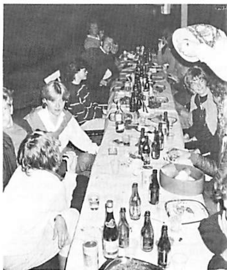
SMORGASBOARD! The real thing in Sweden.