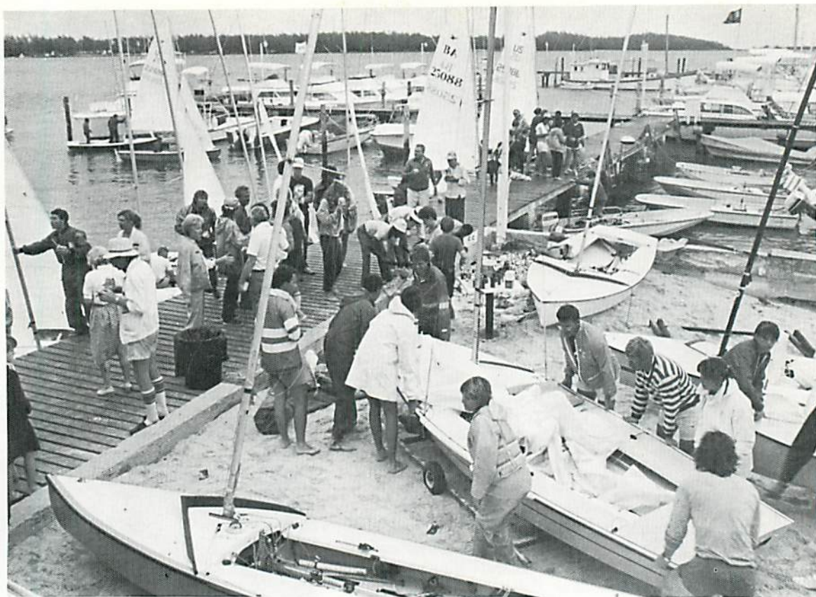
A busy crowd scene: The Tanqueray gin party met the sailors as they came ashore after the third race of the Gambelin Memorial.