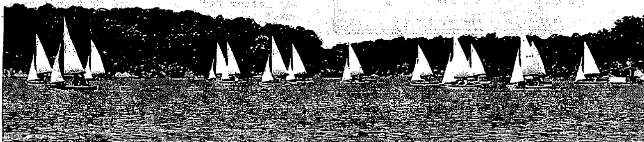
Fourteen of the eighteen Snipes that started in the Fourth Annual Grand Lake Regatta

The last boat took part in Saturday's race only