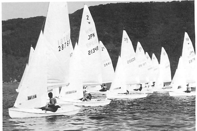
photo : Light air racing on Fukuoka.