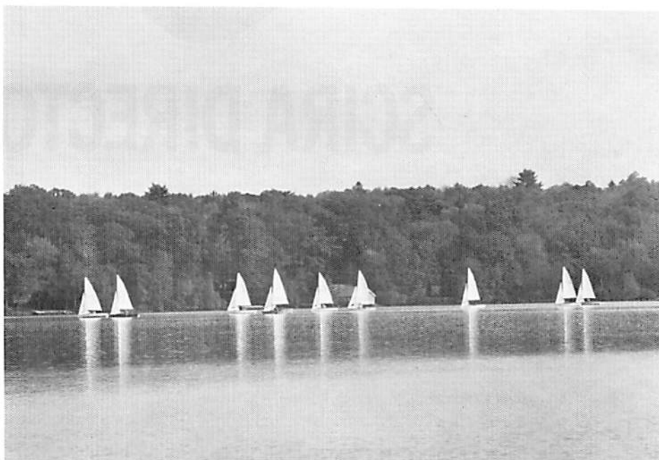
Drifting and shifting obtain new meaning on Lake Quassapaug.

Races 3, 4, 5. Day two, a cold wave brought out the wetsuits, etc., but no more wind. While the sailors were ready to face a lake with which they felt more familiar, Quassy remained a stranger to many. The