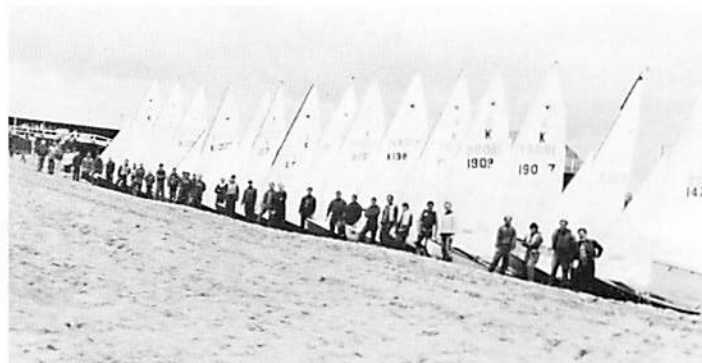
Boats line up for beach launching at Broadstairs Open.