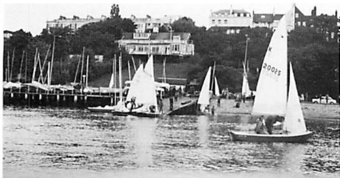
Jubilee Race Week at Alexandra Yacht Club, Southend-on-Sea.