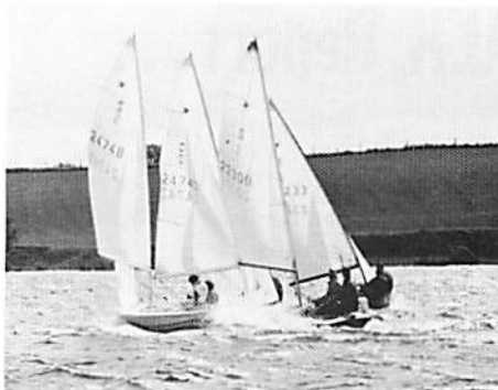
A flock of Snipes at Budworth.