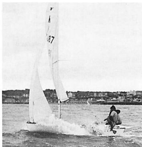
Snipes enjoy a wet ride at Broadstairs.