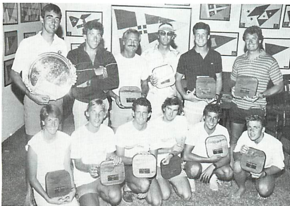
Trophy Winners: The six top skippers, standing, and crews, seated, in order from left to right. See results for names.