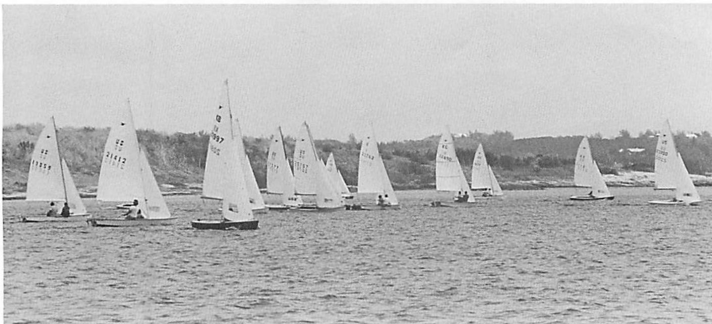
Fleet action at 1979 Bermuda Race Week.