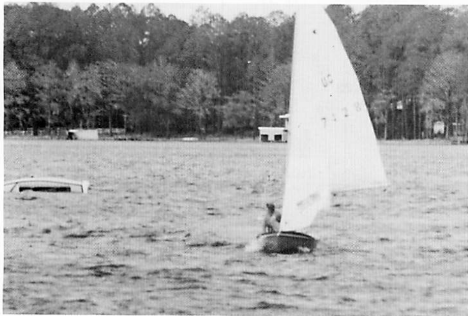
GEORGIA STATE REGATTA (Top 15 of 32 entries)