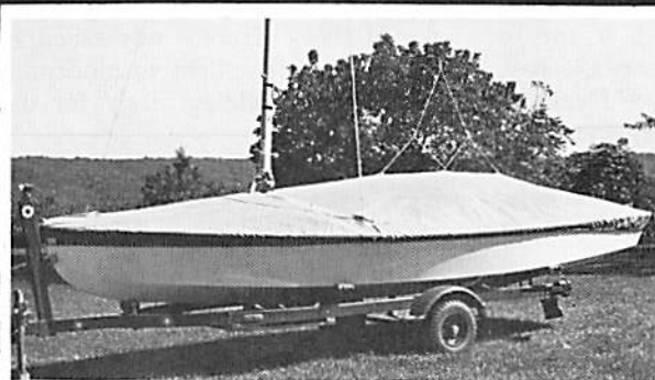
Full Deck Trailing and Mooring Cover (above)