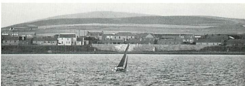
Weather conditions in the Orkneys are extremely variable, as evidenced by the above photos.