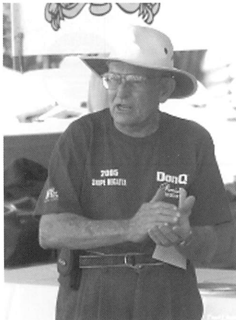
Above: Where would the Don Q be without The Old Man?