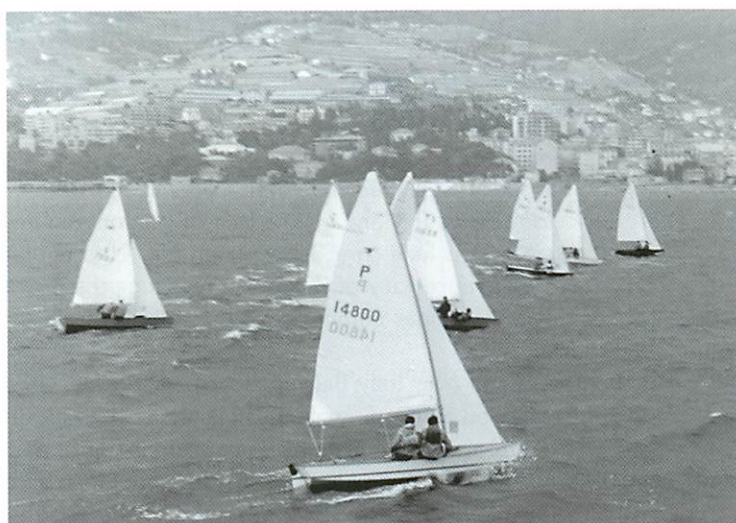
Photo: European Championship in Sanremo 1964 - one of the 7 starts.