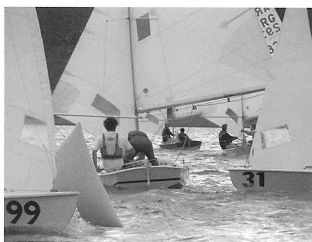
Photos from the Colombian National Championships, Bogota, Colombia.