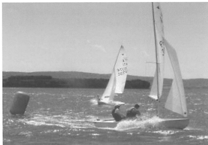
Photo: Snipes on a flying reach in Muggia, Italy

Complete overall results at: http://www.snipe.it