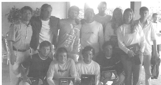
Trophy winners gather at the South American Championship in Algarobbo, Chile