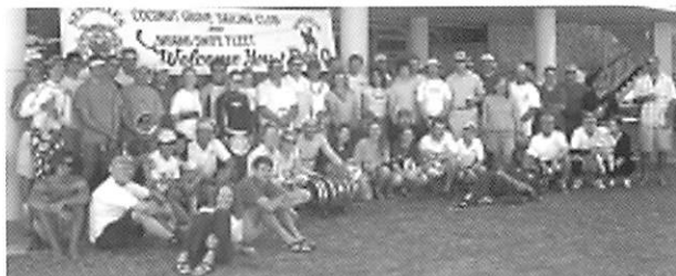
Right: Competitors and trophy winners gather for the annual group photo.