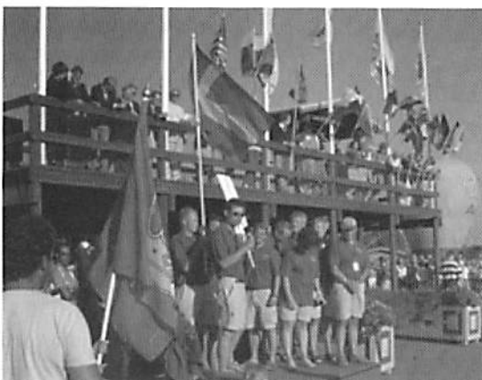
Borstahusen Sailing Society welcomed the Snipe Sailors from around the globe. Swedish Snipe team is welcomed by their countrymen.