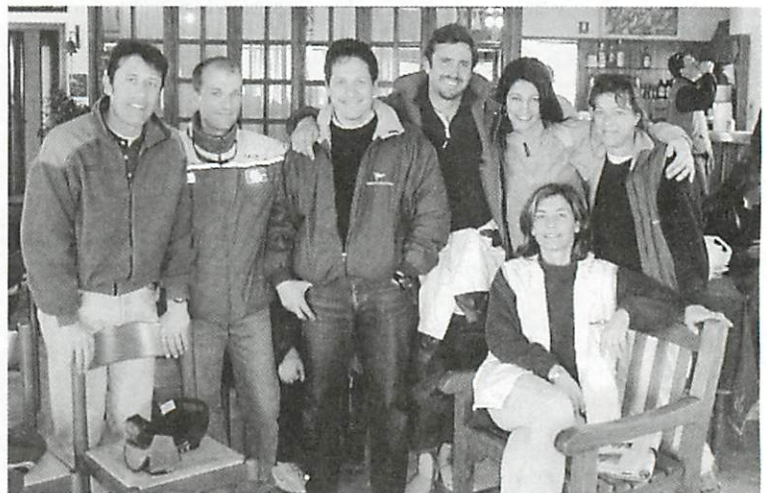
Sailors from Italy and Argentina gather for a photo at in San Remo