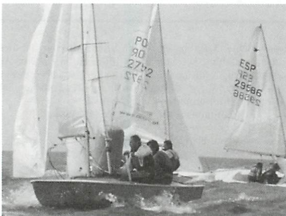
Portuguese Sailors enjoy the ride