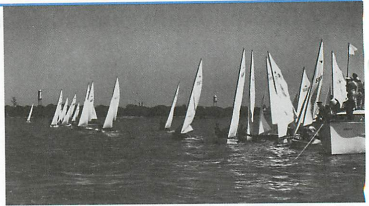
1939 Midwinter start

The wind built until the middle of the second race when the seabreeze (westerly) began to win out over the prevailing easterly, so the wind began to weaken for the third race. After all of the great wind yesterday this 6-8kts with holes was difficult. At the second leeward mark, the end of the fleet sat in a hole for a