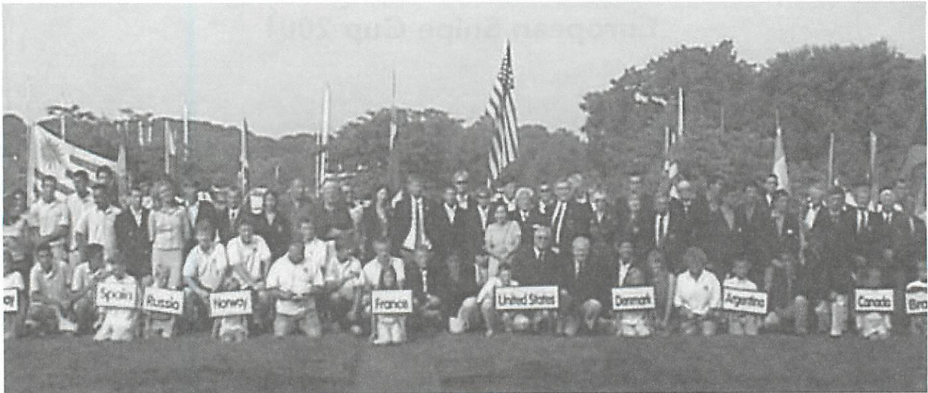
Junior World competitors gather at Opening Ceremonies