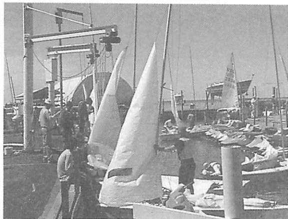
Dock scene @ Mentor Harbor Yacht Club