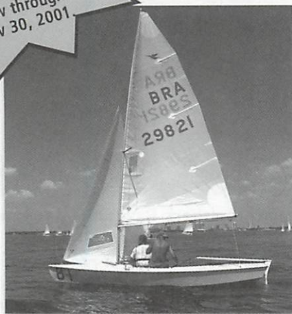
Team Paradedá, North American Champions Powered by the North AP-3+ Main and BR-1D+ Jib

Find complete information on the new North Snipe models at www.northsailsOD.com