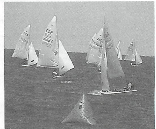
Below: When the day was blown out, Opti races were held. Brazil won 1-2!