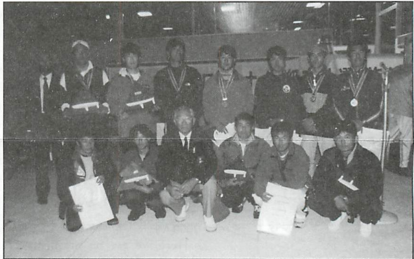
Japan National Championship action.

Regatta conditions on the sea were unfortunately not so good. The wind was light and shifty and the current was so strong. We could only complete 5 of the 7 races scheduled due to the lack of wind speed. In spite of these unstable conditions, the expected strong teams finished in the top positions. The winner was Ida/Yamazaki. It is their second win and they competed in the Worlds in San Diego. Second was Morita/Setoguchi, and Morita participated in the '97 and '99 Worlds. Third was Yoshioka/Ikebe and they also participated in the Western Hemisphere at Enoshima, Japan in 1998. Fourth was Abe/Yoshida. Fifth was Takamura/Maruyama, and they also participated in both the '97 & '99 Worlds. Sixth was Masuda/Kondo. The top five have qualified for the 2000 Western Hemispheres in Argentina.