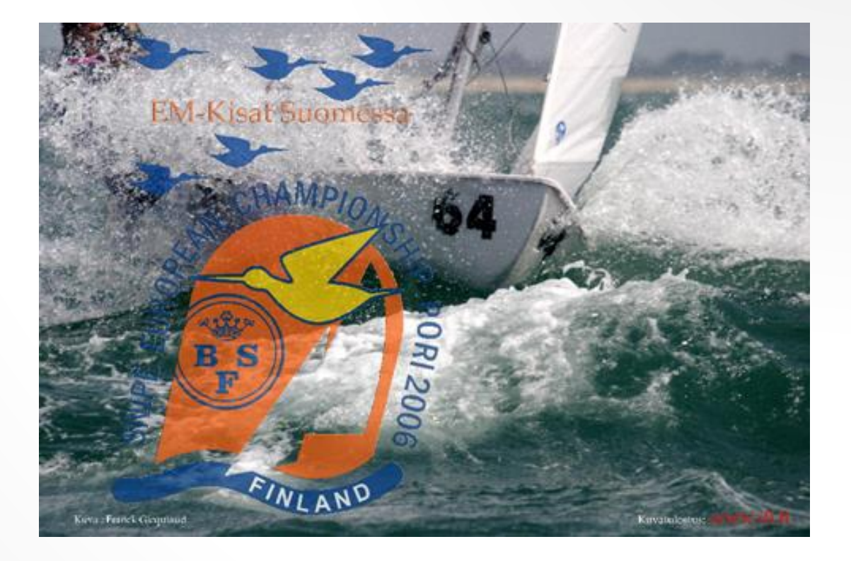
EC2018 in Finland will boost the position of our Class in Northern and Eastern Europe!