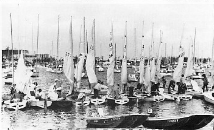
1979 DON Q RUM KEG REGATTA (Top 29 of 55 entries)