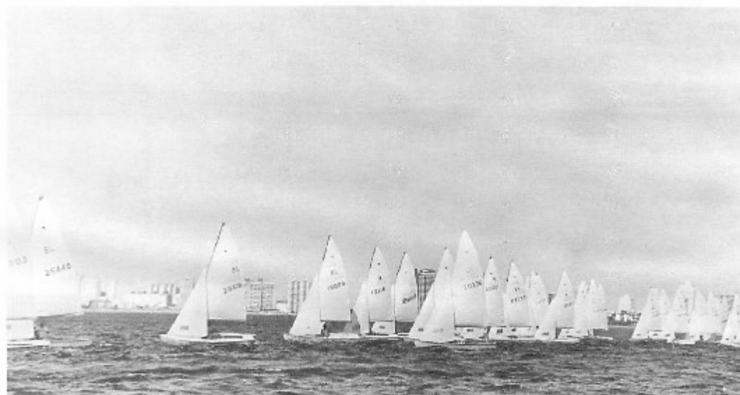
Starting line crowd at the start of the first race. The skyline of Punta Del Este is in the background.