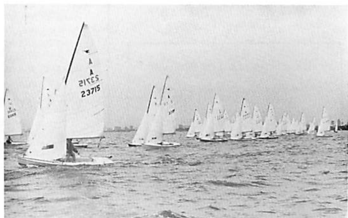
Starting the 3rd race.