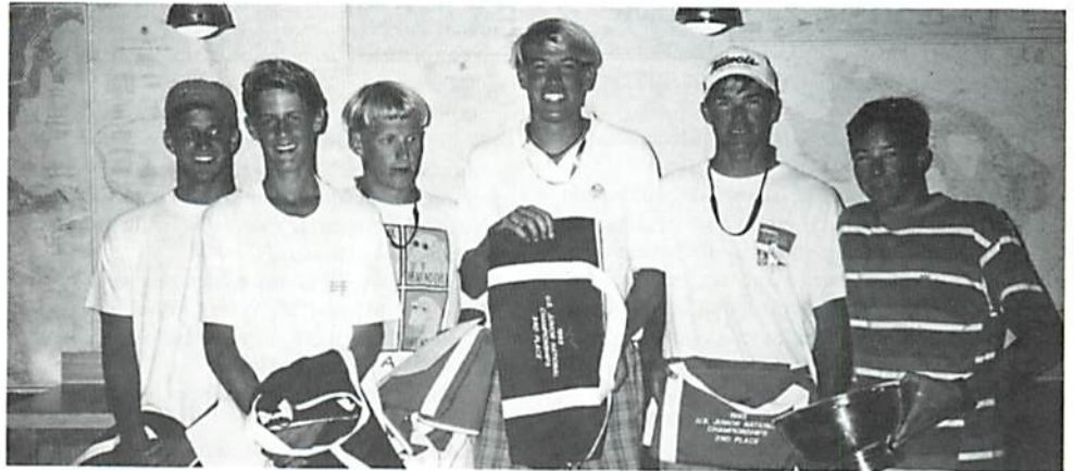
1993 Junior National Trophy Winners