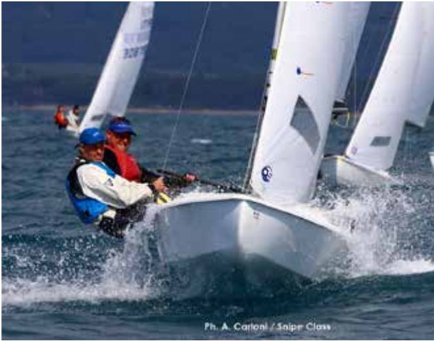
Ph. A. Carloni / Snipe Class