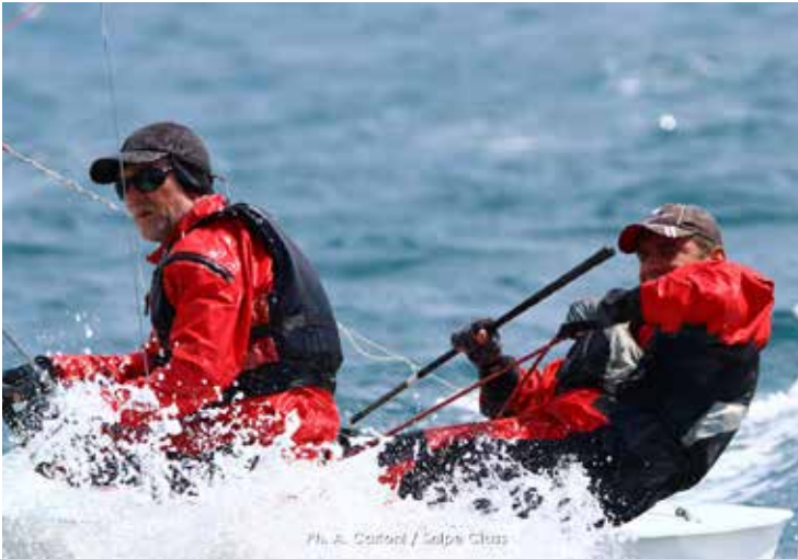
Snipe Class