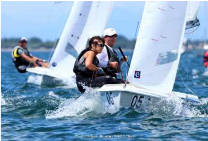
SNIPÉ Class