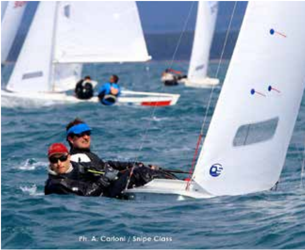
Ph. A. Carloni / Snipe Class