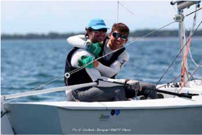
Carlisle - Bangor / SNIPÉ Class