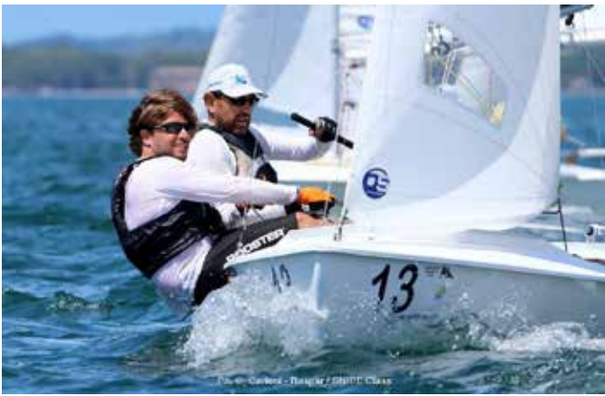
Bangor / SNIPÉ Class