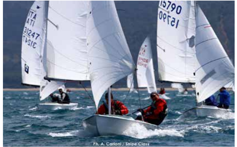
Ph. A. Carloni / Snipe Class