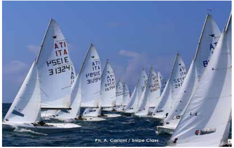
Ph. A. Carloni / Snipe Class