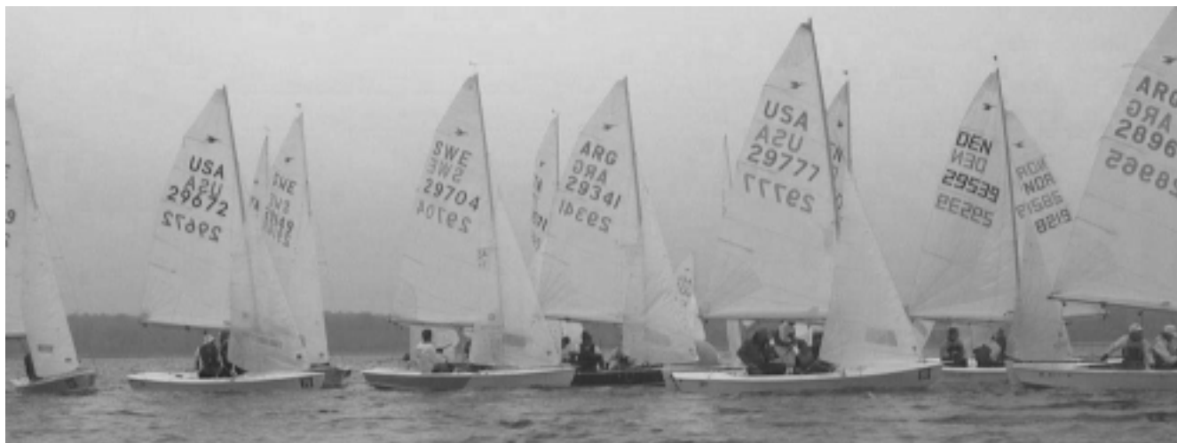
Leeward mark rounding, day 2.