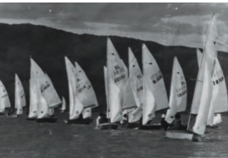
above from the archives: start of 1973 Brazilian Nationals. start of 2008 Brazilian Nationals taken by Rosanne urt.