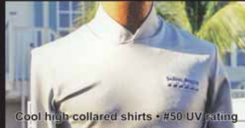
Cool high collared shirts • #50 UV rating