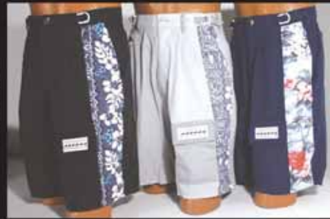
Padded optional sailing shorts 26-44, 4-16 red, khaki, navy, black, grey, aloha black, aloha silver.