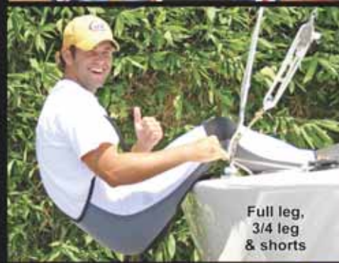
Full leg, 3/4 leg & shorts