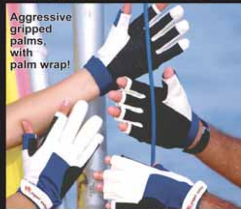
Aggressive gripped palms, with palm wrap!