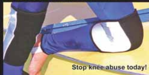
Stop knee abuse today!

www.sailingangles.com Miami, Florida 305.661.7200