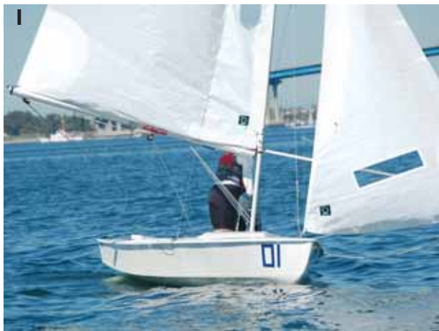
Photo 1: In lighter breeze, the crew stands and leans hard against the raised daggerboard to initiate the boat to roll to windward ( do this often enough and hard enough and you'll have some lovely bruises! ) Place your feet perpendicular to the board and lean hard, heels against the edge of the cockpit floor – you will most likely lean over the board which will also initiate your duck of the boom. While in this position, keep your weight forward (or to windward) and an eye on the pole and the jib. Skipper stays on the windward side for the roll. Notice how the pole is parallel to the boom.